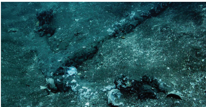
Discovery with Argos. The anchors that created the anomalies above were found in minutes by Argos. The anchor pictured was entirely buried; this image shows it post-excavation.